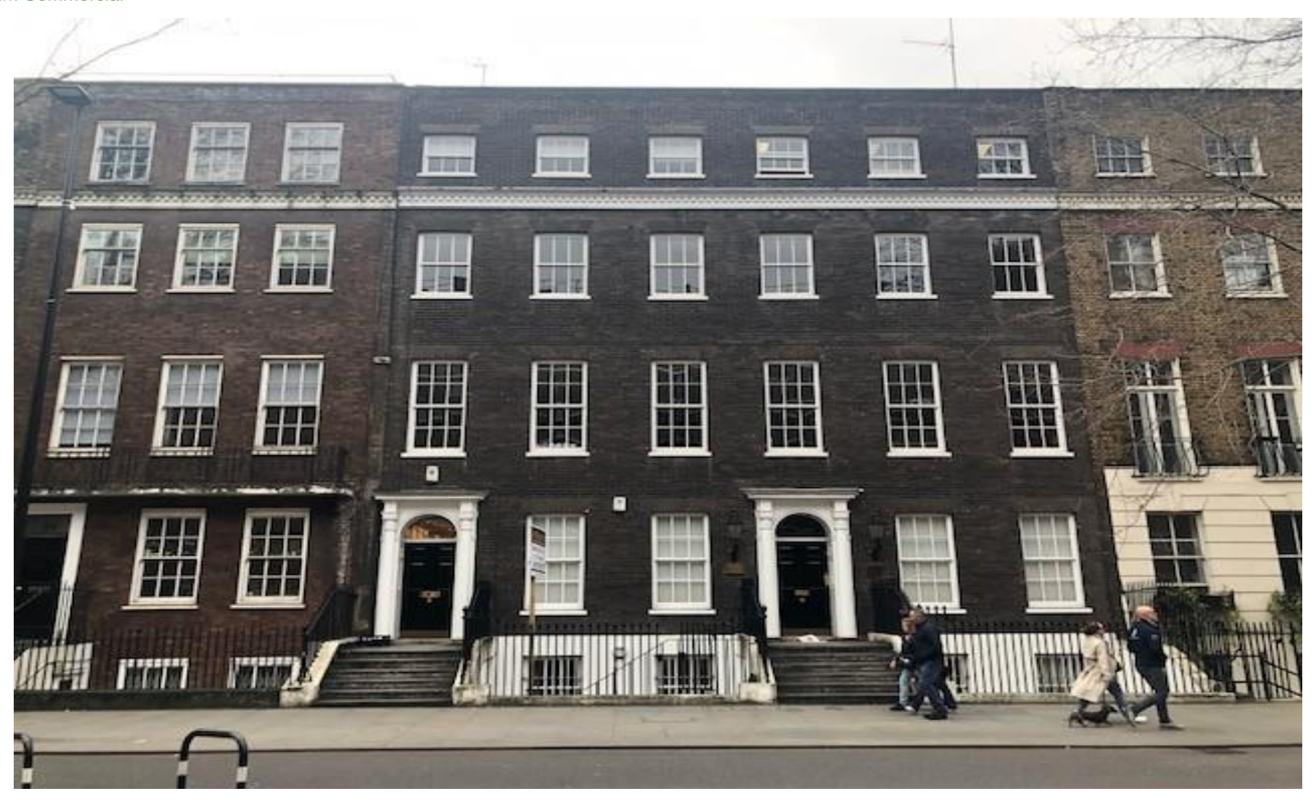
82-83 Blackfriars Road, London SE1 8HA From 1,121 sq ft – 5,478 sq ft